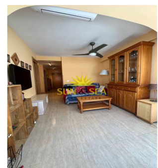
Alicante - Calpe